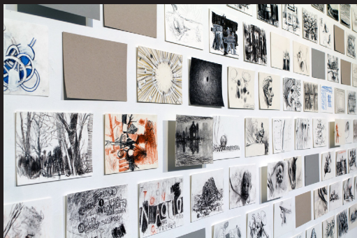
Kenneth Pils "Diary of Anything", One drawing a day to disclose tacit knowledge, ongoing since December 2013, charcoal on 400 gram paper