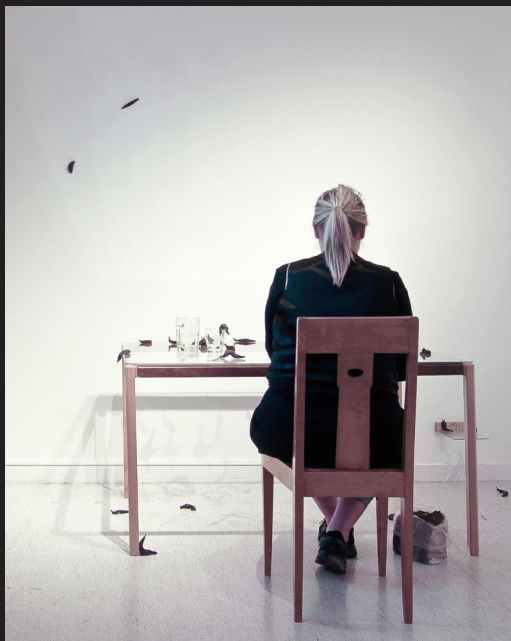
Lotte Nilsson-Välimaa Installation "To dwell upon" (table, glass, chair, snails in clay, glue)