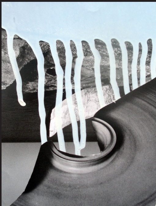
Bertram Schilling "Alles rein", collage